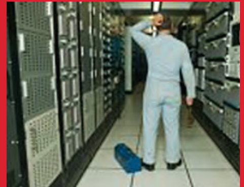
Server and communications facility