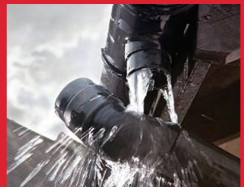
Plumbing systems and suspended pipes