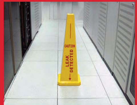
Raised floor computer facility