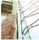
Snow Melting and De-Icing